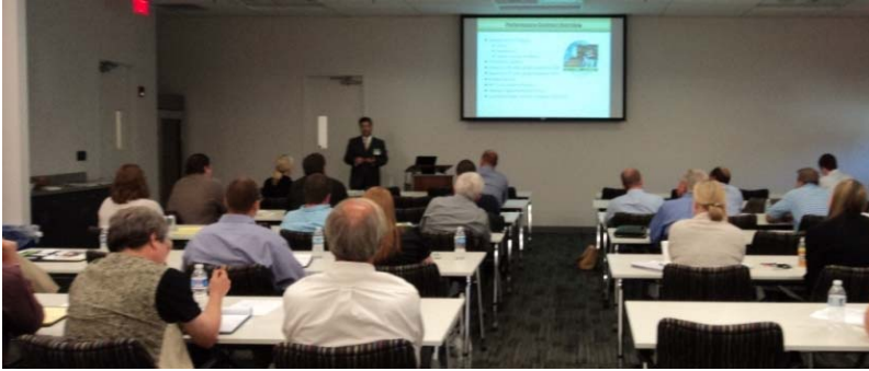
NCC BCA Event at Tozour Energy

The NCC-BCA Event was held on September 8 at Tozour Energy Systems in King of Prussia, PA. It was attended by approximately 40 people. There was a diverse crowd of building owners, vendors, commissioning providers, architects and contractors that made up the group.