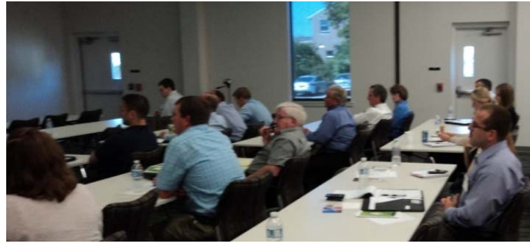
NCC BCA Event at Tozour Energy

The day started out with a presentation on the Existing Building Commissioning and Energy Savings. This presentation reviewed the EBCx process in accordance with the "Best Practice for Existing Building Commissioning", the benefits, and discussed several examples of some of the potential energy savings from an item in the master list of findings of a project.