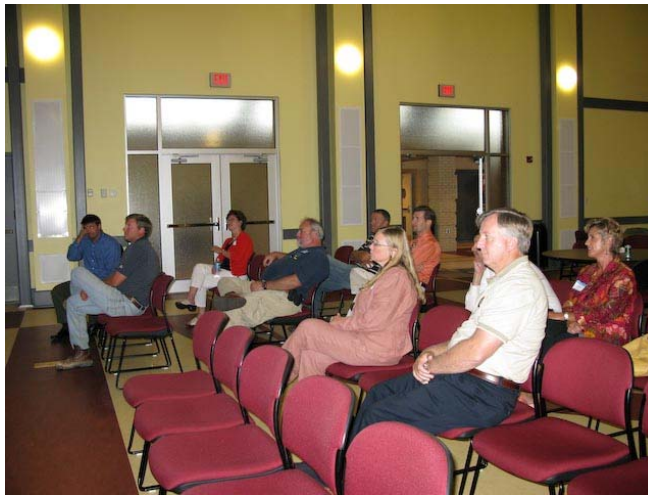
A rapt audience at the July 23 rd Roanoke Meet & Greet